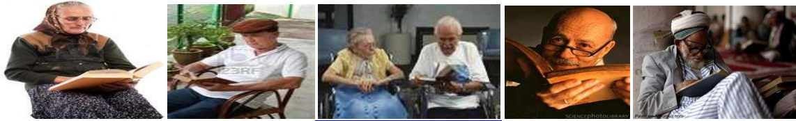
Elderly the reading a donated book or magazine

Euphemisms and terms for old people include seniors (American usage), senior citizens (British and American usage) and the elderly . As occurs with almost any definable group of humanity, some people will hold a prejudice against others — in this case, against old people. This is one form of ageism. There are hundreds of thousand homes for the elderly and/or senior citizens, many who do not have access to books or even magazines. In addition, many Senior citizens, due to limited economic power are unable to purchase books or magazines worldwide. This is the situation in all countries.